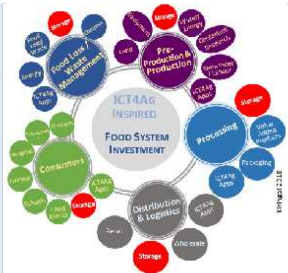
Figure 1 : The Food System is the driver of the aTex Hub

Since the P4ACAD and its implementation through the aTex Hubs is an agribusiness initiative, any activity that appears in other value chain layers, or subsystems within the Food System, is integrated and supported as a food system activity thereby creating centralization of actions, with an ICT4Ag Inspired implementation. It is the strategic centralization focus that is needed in the agricultural space, yet no other initiative takes lead. We do!